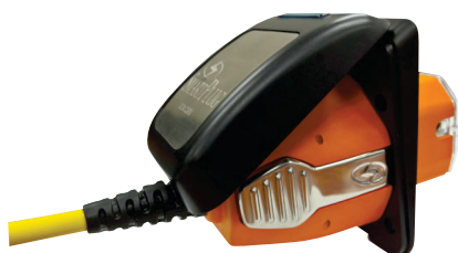
16 AMP INLET & CONNECTOR