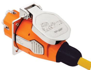
32 AMP INLET & CONNECTOR