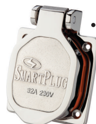
32 AMP 230V