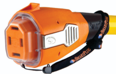
WEATHERCAP W/ LANYARD Works with 16 & 32 amp plugs