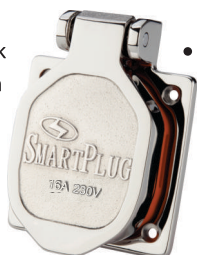
16 AMP 230V